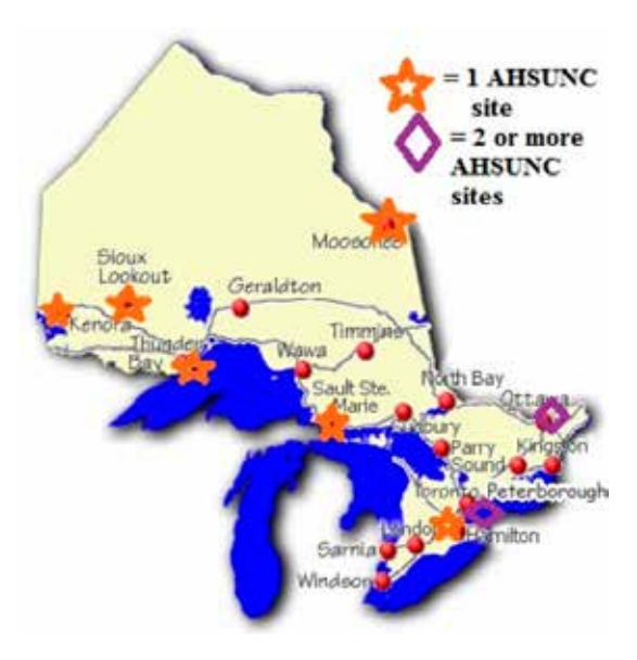
Figure 1: Map of Aboriginal Head Start Urban and Northern Communities Projects in Ontario

The Aboriginal population is the fastest growing population in Canada at 1.7 times faster than the non-Aboriginal rate (Cox, Hanselmann, 2001; Mendelson, 2002; 2006). The statistics also show that more than 62 percent of the Aboriginal identity population resides in off reserve areas like cities and rural towns (Mendelson, 2006). The Aboriginal population is younger than the overall Canadian population. According to Statistics Canada (2006), the there is a total of 147,820 self-identified Aboriginal people in Ontario with 17,400 of those being children between 0 and 4 years of age in off reserve communities (Figure 2). As mentioned early, 560 Aboriginal children between 3 and 5 years old receive AHSUNC programming, which is approximately three percent of the off reserve self-identified Aboriginal children in Ontario.