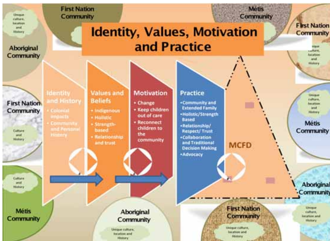
Figure 1: The identity, values, motivation and practice of Aboriginal professionals

The visual map below illustrates prevailing themes that emerged in the study regarding how MCFD Aboriginal professionals’ described their identity, values, motivations and practice approaches.