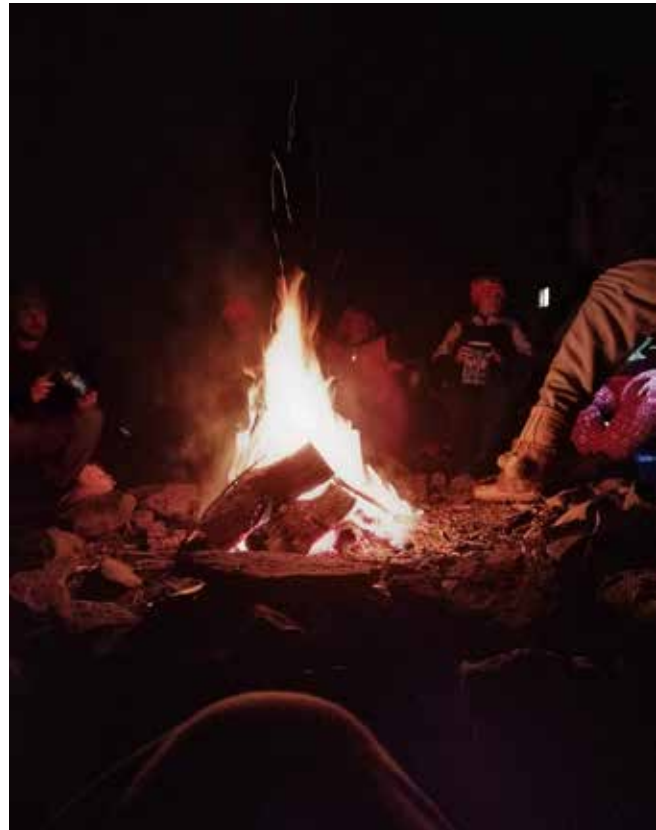
Bonding Around the Campfire